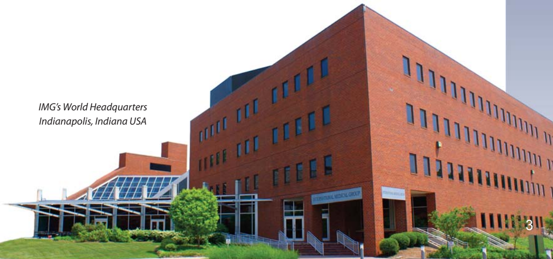
IMG's World Headquarters Indianapolis, Indiana USA

GCMI covers the Usual, Reasonable and Customary (URC) charges for eligible expenses in the area where you receive treatment. Each insured person will only need to satisfy their deductible once per period of coverage (12 months). For eligible expenses incurred in the U.S. and Canada (if applicable): once the deductible is met, GCMI pays 80% of the next $5,000 in eligible expenses, then 100% of eligible expenses up to the policy maximum. For eligible expenses incurred outside of the U.S. and Canada: once the deductible is met, GCMI will pay 100% of eligible expenses up to the policy maximum.